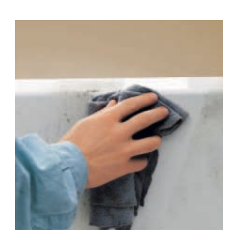
Easy to clean