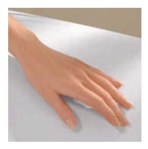
Smooth, pore-free surface

Quaryl® products also have slip-resistant properties. This creates a feeling of safety.