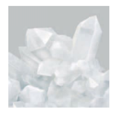
It all starts with quartz crystal

The unique liquid mixture comprising 60 % quartz and high-quality acrylic resin can be moulded into any form using a high-precision casting method for the manufacture of Quaryl® products. The resulting Quaryl® is a unique material with a thickness of up to 18 mm. Thanks to its durability, Quaryl® has provided a successful foundation for numerous product and design innovations for years.