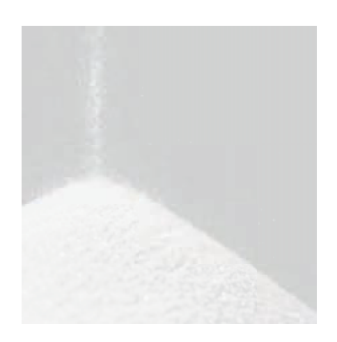
The basis: 60 % pure, fine-ground quartz powder