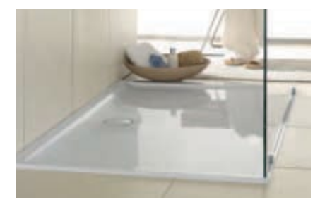
Futurion Flat shower tray