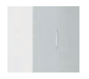
Invisible Jets pop-up side jets