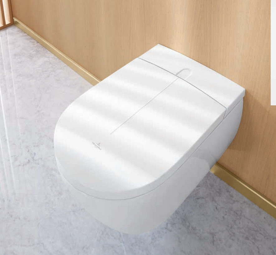
VILLEROY & BOCH BRAND ELEMENTS A fine hairline directs the gaze from the Villeroy & Boch logo to an elegant recess. This picks up on the archway in the logo and symbolises the brand's combination of tradition and innovative strength.

REVOLUTIONARY DESIGN Be amazed by a completely new shower toilet design. For the first time ever, the entire technology is integrated in the ceramic rather than the seat. This allowed us to design the toilet lid absolutely flat and linear, making the shower toilet not instantly recognisable as such.